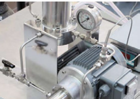
ULTRAFILTRATION LAB PILOT – NANOFILTRATION

Specialised in treating water and wastewater to respect discharge and recycling requirements, FIRMUS France works with all today's latest technologies, leveraging over 20 years experience in membrane-related techniques, including: microfiltration, ultrafiltration, nanofiltration, reverse osmosis, electrodialysis, membrane electrolysis, bipolar membrane electrodialysis, dialysis and more.