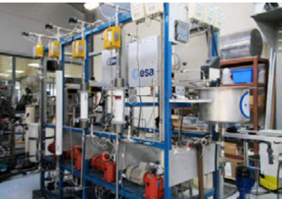
ESA PROTOTYPE – GREY WATER TREATMENT UNIT